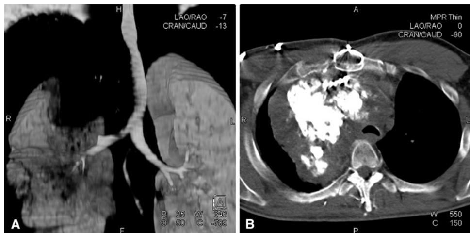
Fig. 1 Patient # 1: a A volume-rendered 3D CT image in which the black space represents the mediastinal mass showing the effect on the airway. b CT showing the size of the calcified anterior mediastinal mass with lateral displacement and tracheal compression